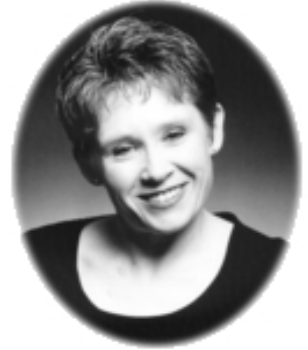
Service With an Old-Fashioned Touch